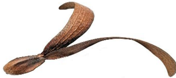
Dried fruit of a Shorea tree

Which part of the fruit helps with seed dispersal? Why?